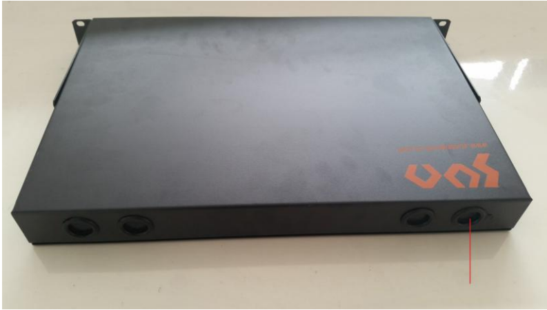
Cable entrance and exit